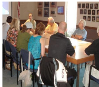
Kelowna Chamber hosts HST Roundtable

on the impact that this tax shift will have on business.